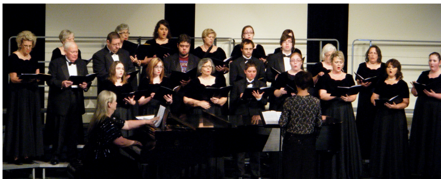
Kimbrough Choir performing at a recent competition held in Fort Smith

For more information contact Trammel at 870-248-4000, ext. 4188.