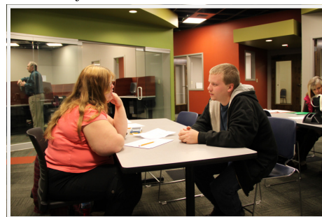
BRTC students are utilizing the new Learning Center on the Pocahontas campus.

students will be pleased, and we believe their grades will reflect just how much.